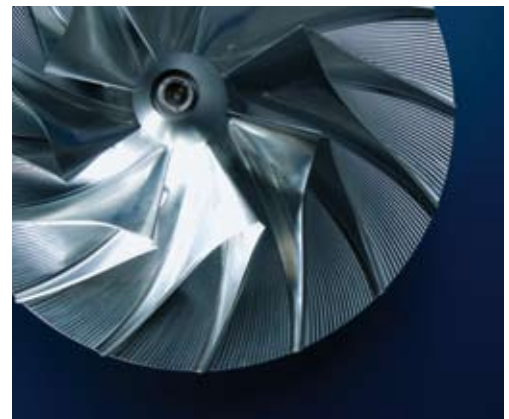
Performance Curve 5069 MTC 50125